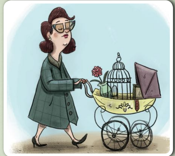
Dora the Storer