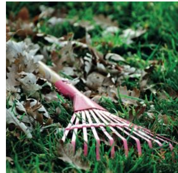
Raking up leaves