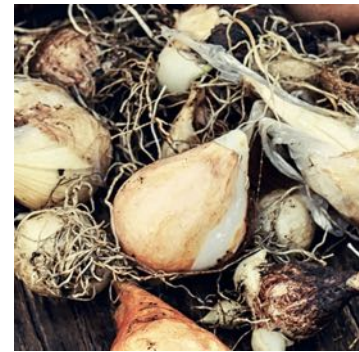
Bulbs ready for planting